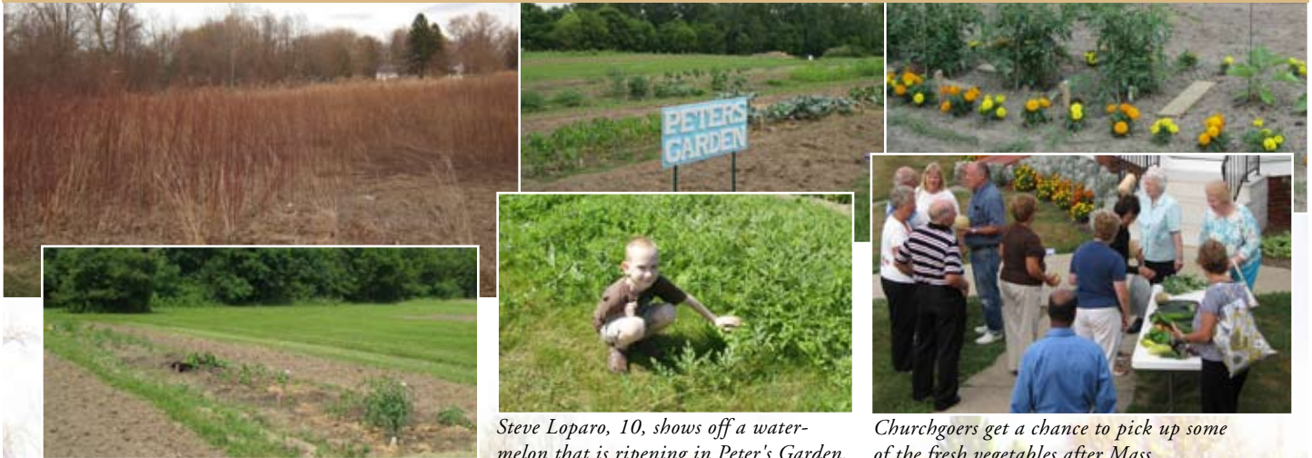
Steve Loparo, 10, shows off a watermelon that is ripening in Peter's Garden.